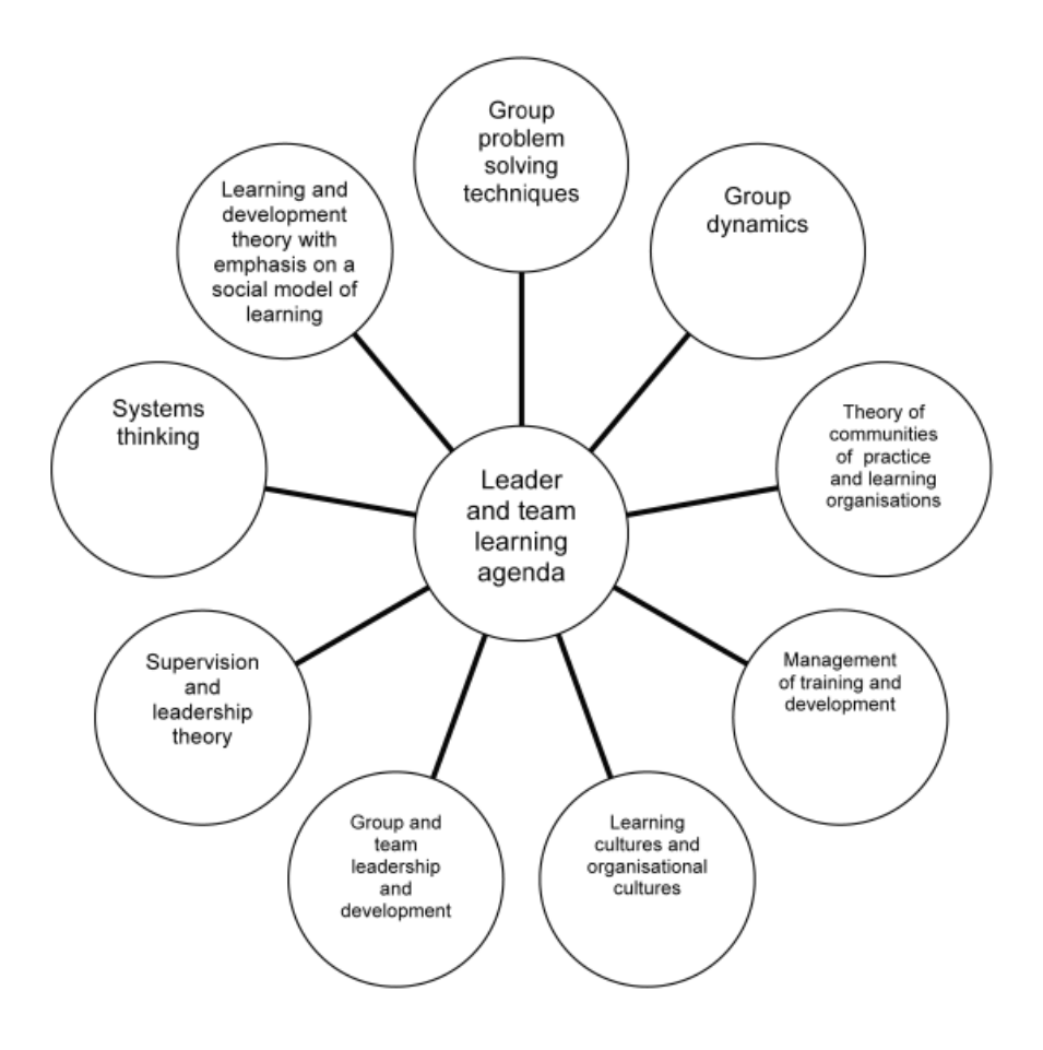
Fig 2. Leading a community of practice: The theoretical domain