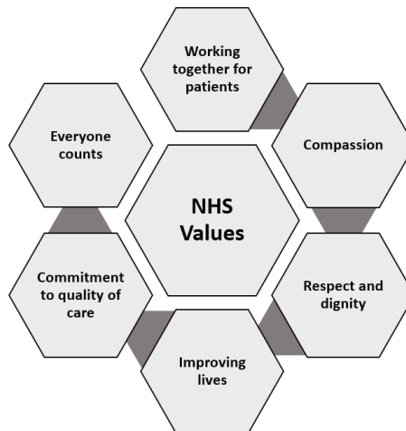
Figure 1: The NHS Values

The NHS Constitution aims to safeguard the underpinning principles and values of the NHS, emphasising the behaviours expected of all NHS staff (DH, 2015). It is a combination of patient/public and staff rights and pledges that the NHS is both responsible for and committed to achieving. The values are illustrated in Figure 1 below: